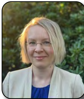
Co-Editor in Chief

Centre for Criminological Research, Department of Sociology, University of Alberta