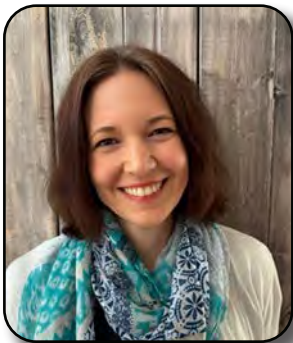
Co-Editor in Chief

— The ASC Executive Board and Publications Committee