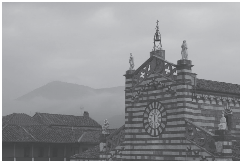
Picture: View from the classroom window of the Cattedrale di Santo Stefano

I arrived in Italy during mid-semester break. After arriving at the airport in Florence I was taken to my new apartment at Torre Degli Ammannati which was right next to the Castello dell’Imperatore (Emperor’s Castle) in Prato, which is in the Tuscan region. We went to lunch at Tenuta di Artimino (Artimino Estate) near Florence and had a chance to discuss the hand-off of the semester. Students were on break so many of them traveled to other parts of Europe. There were numerous restaurants around town that had meal programs for us, so we were able to select where we wanted to eat. The first night I went to one restaurant Caffé el Teatro and asked to be seated for dinner. They asked if I was the new professor. How did they know? In Italy, dinner starts usually around 8 pm, not 6. When I returned for dinner around 7:30, I had the chance to meet a few of the students, and their families who were visiting for Spring Break. This was a great chance to catch up with the students, learn about Prato and all it had to offer.