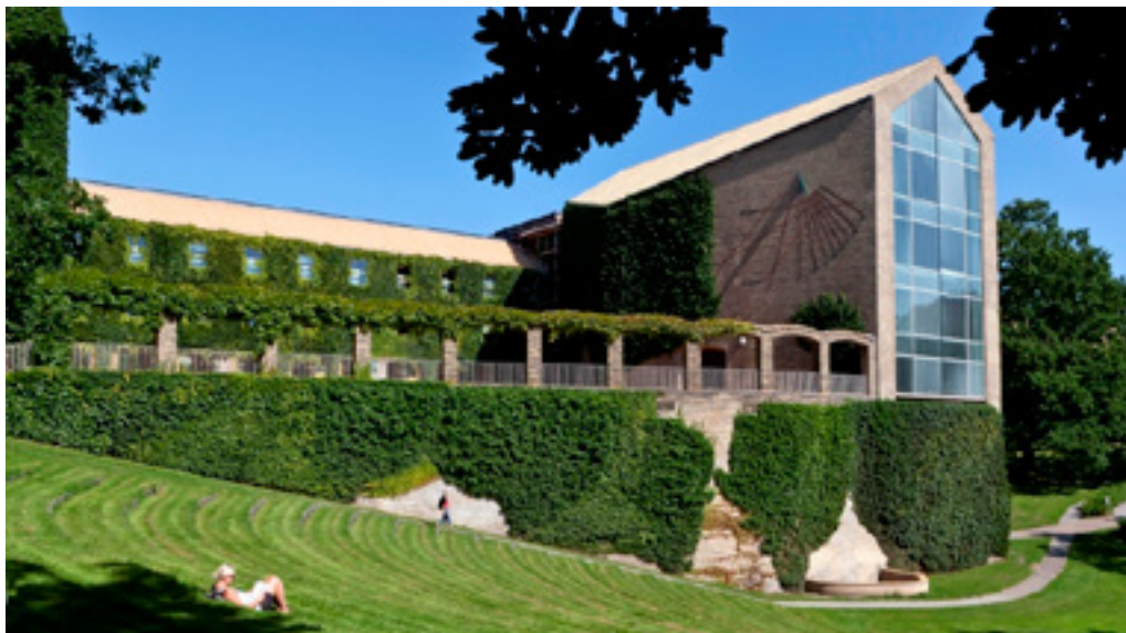
Aarhus University, Aarhus, Denmark