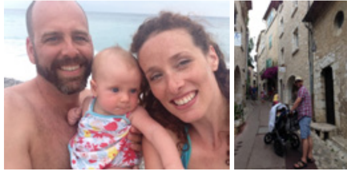
My little family relaxing on the beach in Nice after work, and hiking the medieval streets of Saint Paul de Vence

The logistics of the apartment were complicated enough, but as it turned out, two additional sources of complications emerged: First, my research site, which I had located on a map using the physical address on the chief medical examiner's letterhead, turned out to be research sites (a total of three places, separated by what is called "corniches" in the Nice region, a funny-sounding term for foothills in the middle of the city, with steep streets and buildings hanging off of ravines; imagine the Hollywood hills, but with no car). My ethnographic research, which aims at understanding the complex institutional and cultural contexts in which deaths are classified as homicidal, suicidal, accidental, or natural, required I observed autopsies at the Pasteur hospital site whenever they would happen, visited the forensic anthropology lab located at the school of medicine site every so often, and spent most of the rest of my time extracting data from autopsy files archived at the Cimiez hospital site. All three sites were actually quite far from the apartment, and with no direct public transportation option, I had to take a light rail to a bus, and then walk, or the reverse, depending on where I was heading and from where. I would sometimes have to go from one site to another several times in one day, in typical 100-degree Nice weather. I got to carrying refreshing wet wipes along, as the dead bodies were sometimes not the stinkiest in the room.