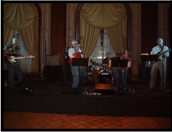
The Hot Spots performing at the Biltmore Hotel