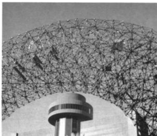
Hyatt Hotel in Phoenix