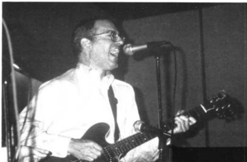
"It's too loud? You're too old!"